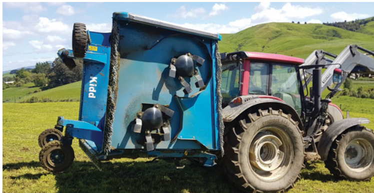
Batwing Rotor design (4 blade)