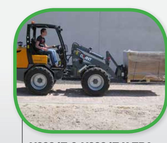
♦ V6004T & V6004T X-TRA

The GIANT V6004T, 60 hp Kubota turbo engine, 14 tons heavy planetary end drive axles with electric 100% differential-lock, top speed 28 km/h. and is the strongest machine of the range. The V6004T has an Z-kinematic lifting arm, lifting height 329 cm. The kinematic system has been designed in such a way to facilitate the quick loading and unloading of your cargo. There is a better visibility on the working tools with Z kinematic. The X-TRA has a lower front frame these GIANT's have a higher tipping load. And because of their lower centre of gravity our loaders are secure and have a good stability even under difficult conditions.