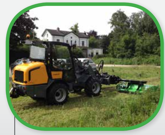
• V4502T / V5003T

The GIANT V4502T and the GIANT V5003T replaces the successful range V4501T - V5002T GIANT Wheel loaders. The new models have a new design, cyclone filter, main switch electro., ROPS/FOPS safetyroof, luxury seat, standard 1 counterweight integrated in the backside. Heavy planetary end drive axles with electric 100% differential lock on both 12 tons axles. The machine has an hydraulic quick change. with 3e hydraulic function. Also an robust Z-kinematic on the lifting arm. The kinematic system has been designed in such a way to facilitate the quick loading and unloading of your cargo. There is a better visibility on the working tools with