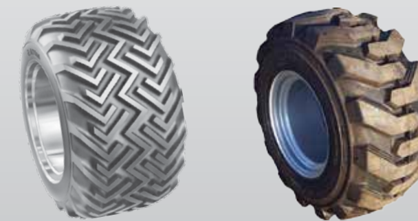
31x15.5-15 TR-06 (76x37 cm) 128 cm machine width