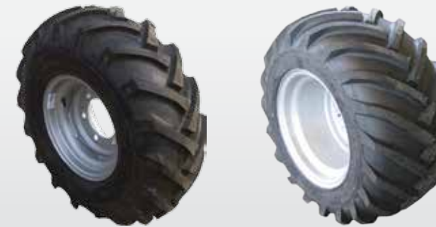
10.0/75-15.3 AS (76x26 cm) 104 cm machine width

The GIANT wheel loaders are equipped with the latest Kubota diesel engines. Which meet the latest emission requirements. The engines are cleaner and have less CO2 emissions. Standard machines are fitted with large water and oil coolers. The engines are mounted on specially designed silent blocks so that vibration and noise level are reduced to a minimum. In order to increase the comfort GIANT wheel loaders have silent blocks under the driver's platform. With a luxury suspension seat with arm and headrest. This machine gives the luxury that every driver want. With the standard hydraulic quick-change system is the connecting and disconnecting of the attachments very easy.